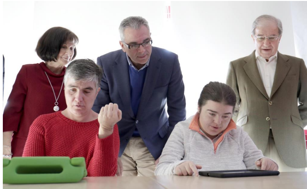
Figure 1. Mobile application

All people with ASD are different from each other, hence the name spectrum, since the characteristics are very variable in each case. So each of these variables can affect how they can learn and develop skills for or against their well-being.