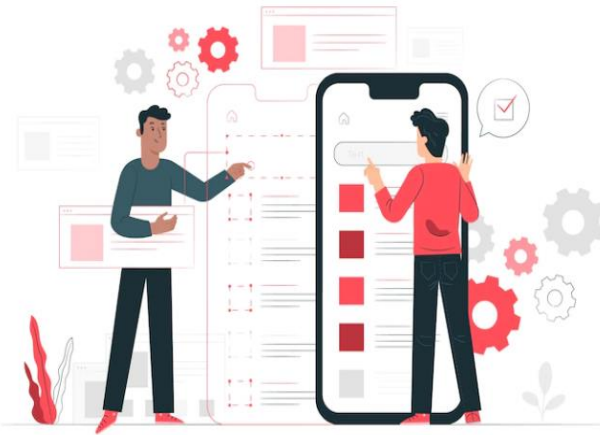
Figure 1. Mobile application

Currently, the use of mobile and web applications provides a technological tool to people with ASD and the people with whom they interact every day. Since they allow for a more fluid interaction between both parties, which increases the development of social skills. However, it is important to identify that several already exist and what benefits they provide or what the focus of care for ASD is.